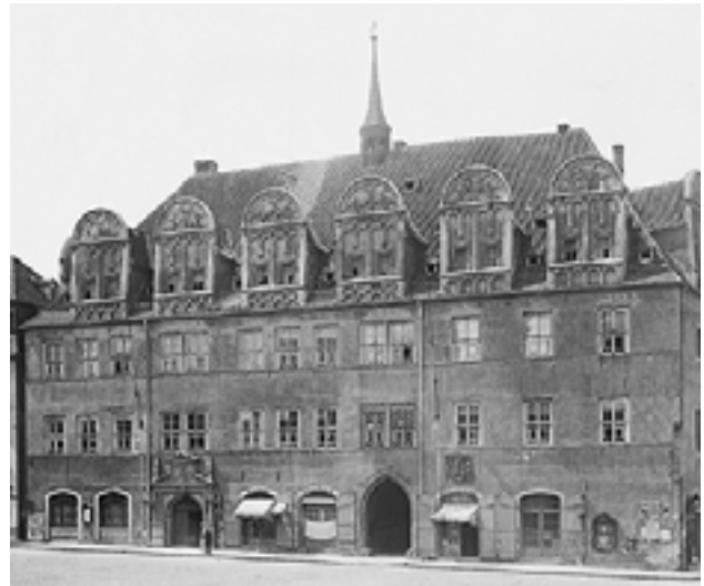
Fig.1: Town Hall in Naumburg, reproduction from Meydenbauer image (1906)

In order to contribute to the high demands on the quality of the rectification of historic metric images, a bicubic interpolation approach was chosen for the image resampling, since, despite the necessarily high computational performance, it delivers the best results. Only with the application of such efficient algorithms in combination with a high scan resolution, metric images, which show sufficient detail resolution even with large scales, can be calculated.