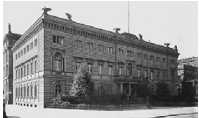
Fig.6: Kommandantur in Berlin, reproduction from Meydenbauer image (1911)

As already explained, the measures of a horizontal and a vertical line on the object are preconditions for a true scale rectification. If these measures can not be deduced from old plans or structural historic details, a rectification is still possible but the scale reference is lost.