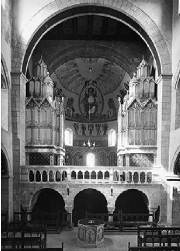
Fig.3: Church St.Cyriakus in Gernrode, reproduction from Meydenbauer image (1907)

If the reference area is a cylinder, an image unwrapping can be applied. We used this method for the evaluation of a historical image of the apse of the church St. Cyriakus in Gernrode (Fig.3). In this case a parametric approach has to be chosen (Hemmler / Wiedemann, 1996). Because of the organ galleries left and right, only the middle part of the historical image could be used for the unwrapping (Fig.4). For restorational purposes the present state has also been evaluated and overlaid with the unwrapping of the historical image (Fig.5). An accuracy between 1 and 2 cm was achieved for this example.