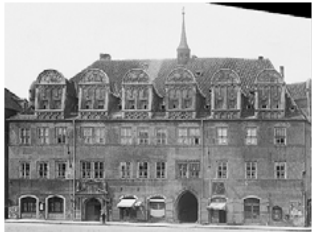
Fig.2: Rectified image of the Town Hall (original scale 1:50)