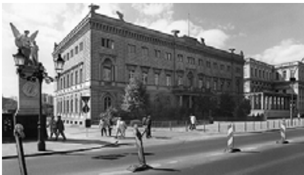
Fig.8 3D-Visualisation of the Kommandantur in present surrounding area

Rectified historical images help to visualise the authentic state of historical monuments in a three-dimensional way. The easiest way to build and view a 3D-photomodel is the construction of a VRML-scene directly from the rectified images (Bölke, 1998). In this case a 3D-CAD-model has to be drawn up first. For higher quality demands, the resolution of VRML-scenes is not sufficient. If it is possible to calculate the camera viewpoint, an image of the present state of the surrounding area can be taken and laid over the historical image (Fig.8).