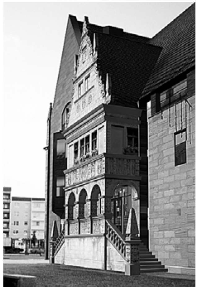
Fig.10: 3D-photomodel of the Town Hall in Halberstadt

But this is only a two-dimensional way. For the reconstruction of a high resolution 3D-model, first a CAD-model is necessary. The data for that model can be determined for instance by Photogrammetric methods. If the building was destroyed, a lavish construction on the basis of historical plans is necessary. After that, the rectified images can be wrapped over the 3D-model with the help of a 3D-rendering software. Fig.10 shows the result of such a work. The 3D-photomodel of the town hall in Halberstadt was derived from present and historical images and shows the building after a possible reconstruction. The texture of the historical building part was completely taken from historical photographs from Meydenbauer from the year 1896. The figure is an image from a digital animation, which lets you walk around the historical building.