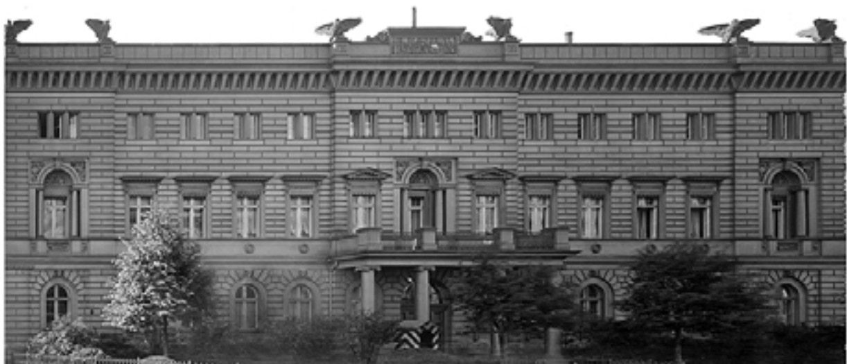
Fig.7 Rectified image of the Kommandantur (original scale 1:50)