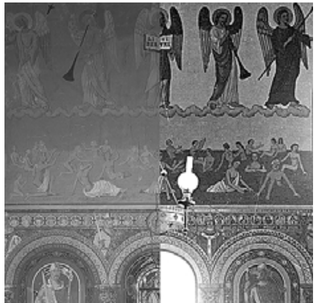
Fig.5: Overlay of historical and present state's unwrapping (detail, original scale 1:20)

the building are available. Then, in the best of cases, the photographs can be oriented in an image network and the coordinates of single points can be determined. Such a bundle adjustment with self calibration is rather costly concerning the effort and can only be applied with success with a sufficient number of photographs and a suitable configuration. Meydenbauer took his photographs with a certain configuration which allowed an evaluation according to his own rules. In many cases this configuration is not sufficient for a bundle adjustment with self calibration. In some cases, amateur photographs can be used in addition for a bundle adjustment. In the following example an insufficient number of photographs with a suitable configuration was available, so the reference point coordinates could not be calculated in the described manner.